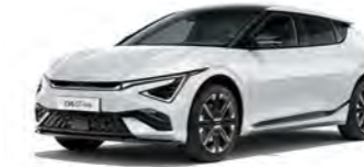
Snow White Pearl (Earth, GT-line)