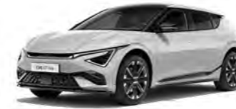
Wolf Grey (Earth, GT-line)