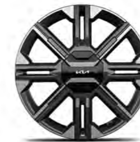
GT-line - 20" Alloy Wheels