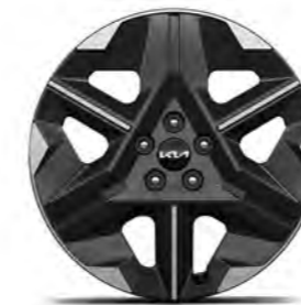
Earth - 19" Alloy Wheels