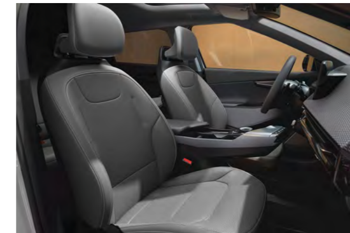
Earth - Medium Grey Vegan Leather