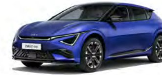
Yacht Blue (Earth)