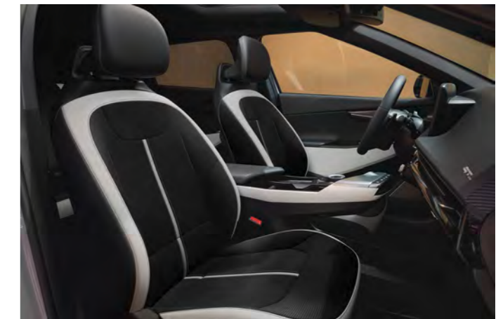
GT-line - Black Suede & White Vegan Leather