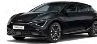
Aurora Black Pearl (Earth, GT-line)