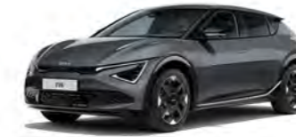
Interstellar Grey (Earth)